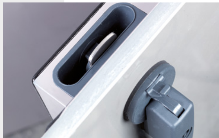
Cold bridge free integrated locks.