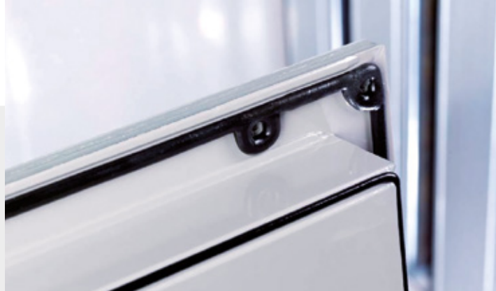
Fully closed vapour tight panel with durable double sealing