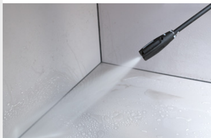
Smooth PET inner wall. Easy cleanable.